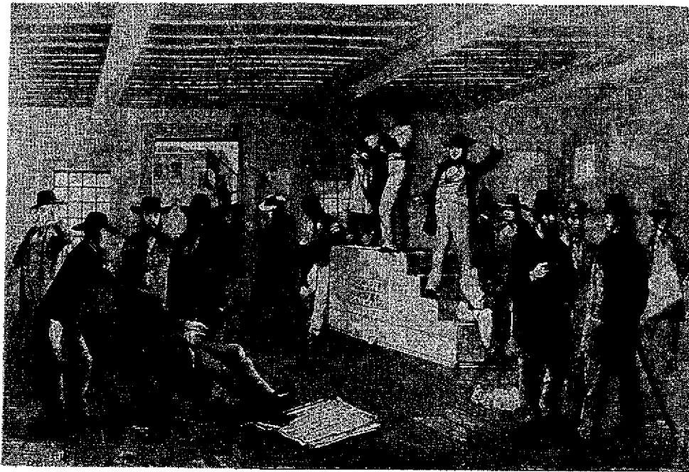
Figure 32. The Auction

centuries, the slaves drew on these memories for their naming practices. Consequently, until the nineteenth century, African cognomens were prominent in any list of slaves. From around 1750 to the 1830s masters steadily encroached on slave naming practices, and by the latter date the bondsmen's cognomens had been anglicized and they exercised less autonomy in this area. Reviewing his enslavement in South Carolina, Lorenzo Ezell recalled in the 1930s: "In dem days cullud people just like mules and hosses. Dey didn't have no last name." Slaves struggled to gain those elemental marks of identity, a first and a last name. While most nineteenth-century slave children were named by their parents, many were named by their masters and mistresses. However much a slave valued his first name, masters placed a low valuation on it. For example, David Holmes testified in 1853 on how fragile was the link between a slave's name, his kinship network, and his identity: "Slaves never have any name. I'm called David, now; I used to be called Tom, sometimes; but I'm not, I'm Jack. It didn't much matter what name I was called by. If master