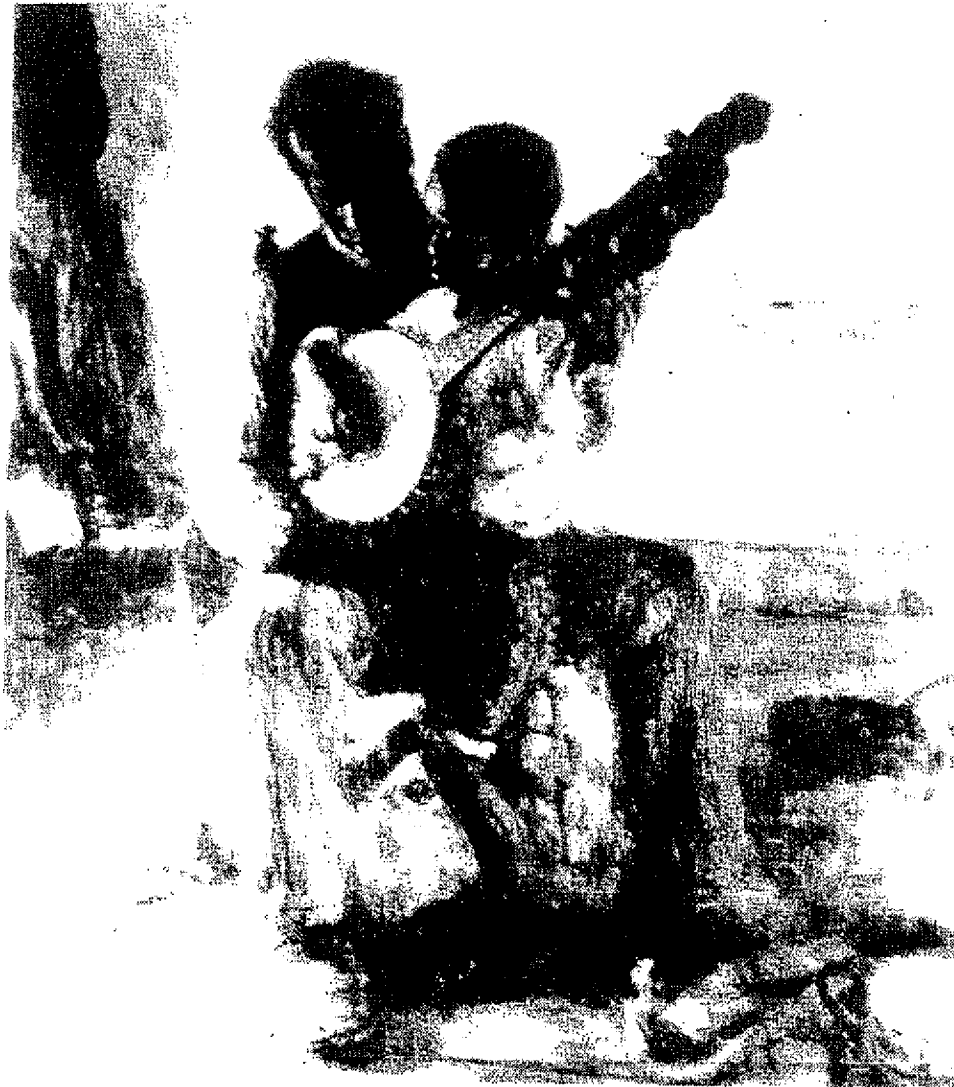
Figure 31. A Father's Love

The routine of the plantation prevented the lavishing of care upon the infant. In this regard, Frederick Douglass, who did not remember seeing his mother until he was seven years old , asserted: " The domestic hearth, with its holy lessons and precious endearments, is abolished in the case of a slave-mother and her children. " 57 On many plantations women did not have enough time to prepare breakfast in the morning and were generally too