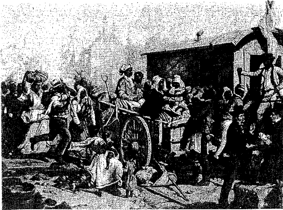
Figures 33, 34, 35. Going South (Figure 34 Courtesy Chicago Historical Society)