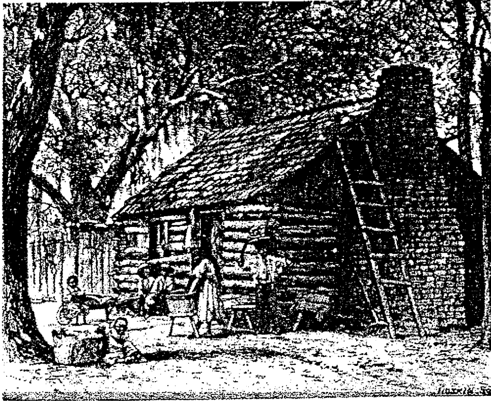
Figure 29. Home

there was less likelihood of fights between slaves when monogamous mating arrangements existed. 3