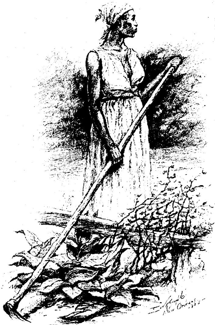
Figure 45. Field Hand