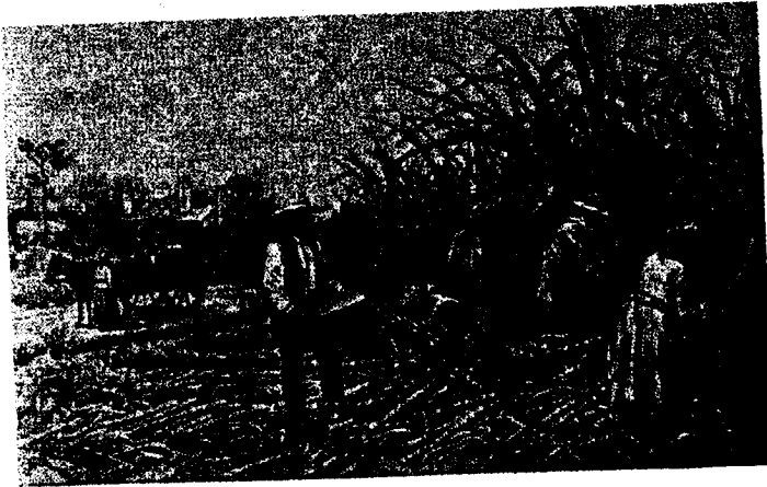
Figures 51, 52, 53, 54. Sugar Plantation