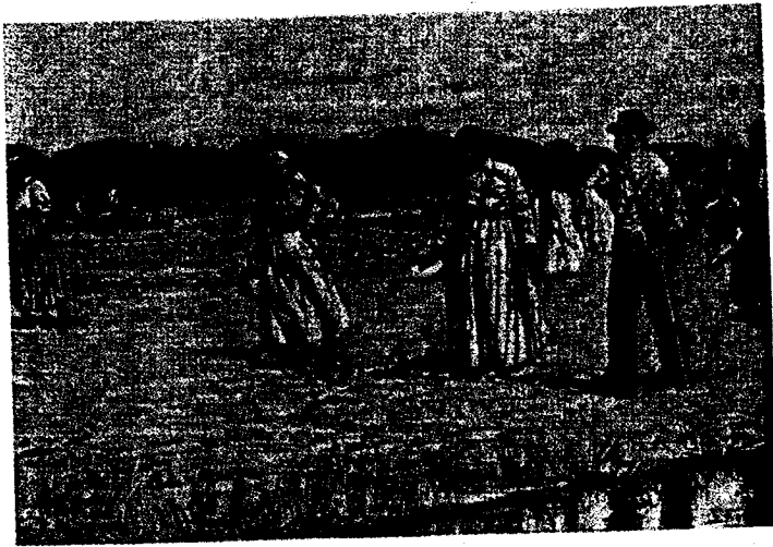
Figures 55, 56. Rice Plantation