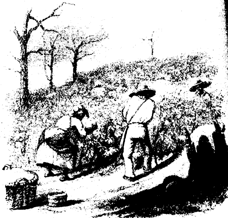
Figures 47, 48, 49, 50. Cotton Plantation