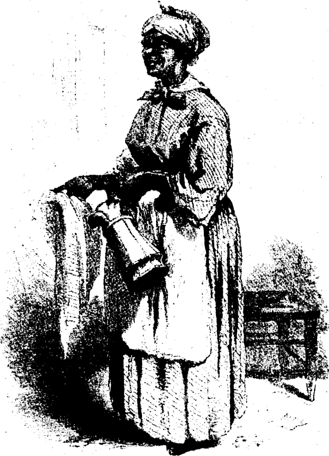
Figure 46. Domestic Servant