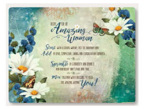
Cathedral Art's Products Cogburn Decl., Dkt. 6-1 at Ex. C