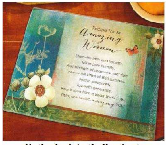
Cathedral Art's Products Cogburn Decl., Dkt. 6-1 at Ex. C

Defendants' item was "in the upper right." (Tr. at 96). The butterflies are plainly in the same upper right quadrant of both.