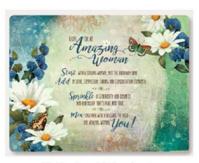
Defendants' Products Compl., Dkt. 1 at Ex. C