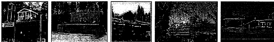
Image results for Goats on the roof - Report images

www.roadsideamerica.com/tip/6548 - Cached - Similar