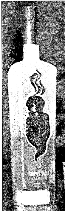
Purple Haze Liqueur