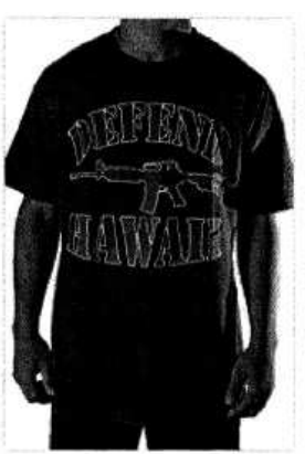
DH! AR-15 LOGO CHAR.HTHR GRY/WHT