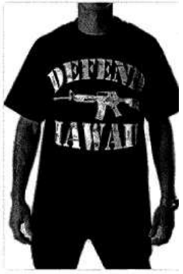
DH! TGP LOGO BLACK

from $25.00 USD to $27.00 USD from $27.00 USD to $28.00 USD from $27.00 USD to $28.00 USD from $29.00 USD to $32.00 USD