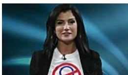
Dana Loesch: What rights do men have that women don't?