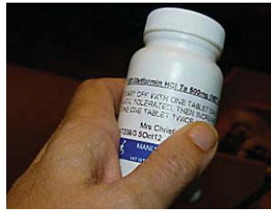
Why Doctors In The Know No Longer Prescribe Metformin Vibrant Health Network