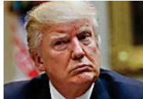
Trump steps up ObamaCare repeal push, meets with...