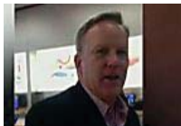
Spicer ambushed by woman in Apple Store