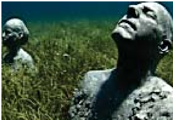
Scientists Can't Sleep At Night Thinking About An... RightBrainNews