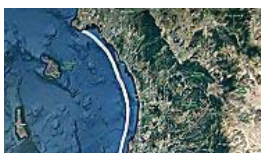
Newly identified fault system could unleash 7.4 earthquake