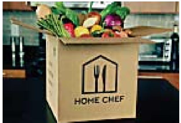
This Meal Service is Cheaper Than Your Grocery Store and... Home Chef