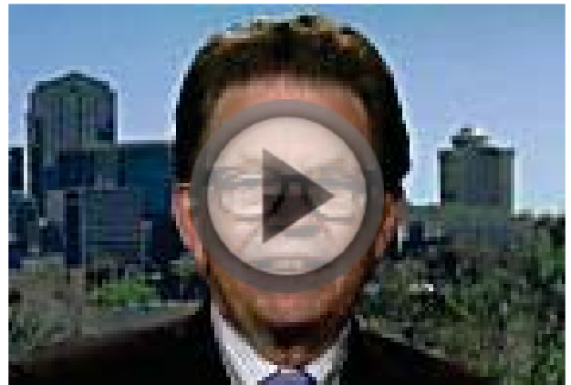
Laffer: Obamacare replacement bill worth 2,000-3,000...