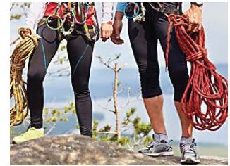
HomeLight - The Fastest Way to Sell Your Home for... HomeLight