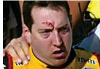
Kyle Busch leaves Las Vegas bloodied after brawl with...