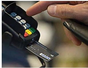
There's a Problem With the New Chip Credit Cards AARP