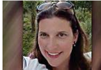
Florida mom reportedly abducted by husband is...