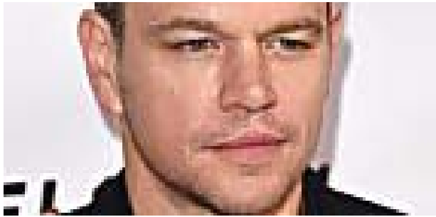
Matt Damon's Waterfront Home Is Beyond Stunning Lonny Magazine