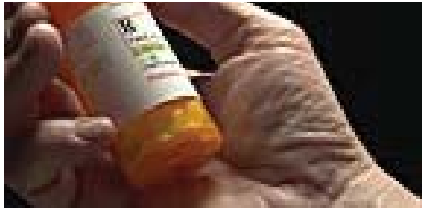
Why Doctors In The Know No Longer Prescribe Metformin Vibrant Health Network