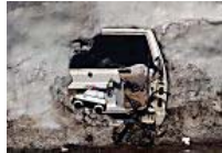
Police find Jeep buried under 20 feet of snow in the...