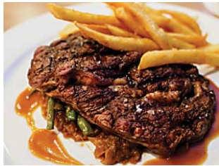
I Tried HelloFresh: Here's How It Went Por Homme