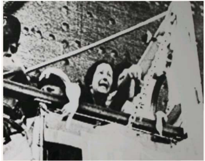
A woman cries as the St. Louis pulls away from Havana, 1939. | Keystone-france via Getty Images

Source: “Some of the 907 passengers on board the St. Louis arriving in Belgium after being refused entry into Cuba and the U.S.”, American Jewish Joint Distribution Committee Archives, “The Story of the S.S. St. Louis (1939)”, http://archives.jdc.org/educators/topic-guides/the-story-of-the-ss-st.html (last visited February 5, 2017).