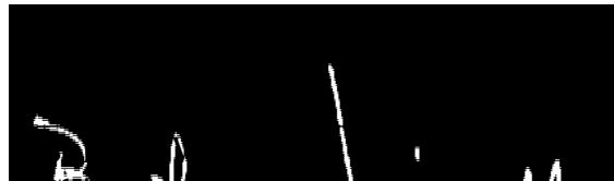
Chief Judge United States District Court