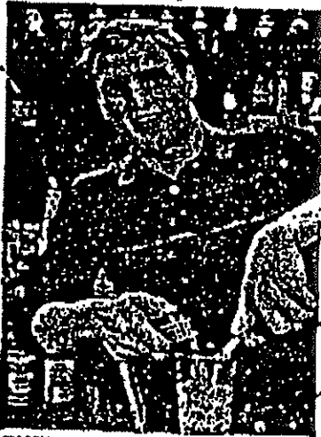
CHEERS bartender Woody Harrelson is conscious of his image.

C HEERS' dumb bartender is no dope when it comes to life on the other side of the tavern bar.