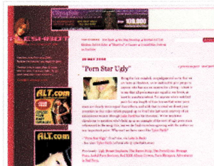
Fleshbot front page