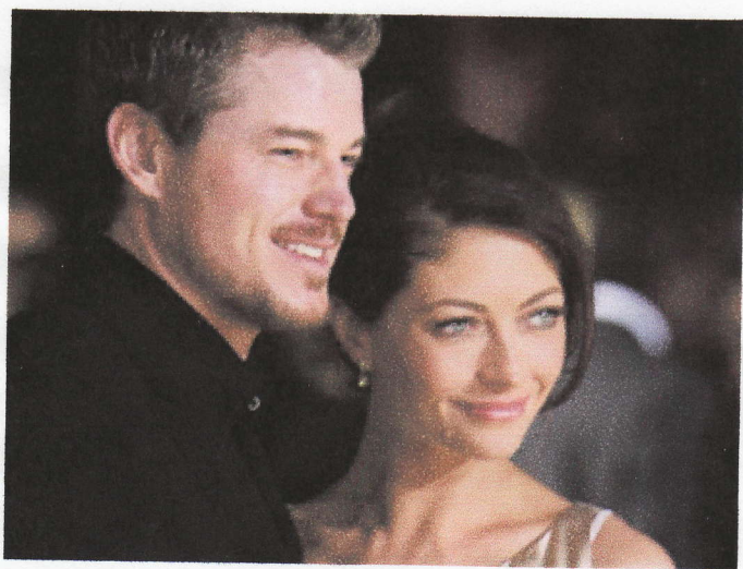
Eric Dane and Rebecca Gayheart