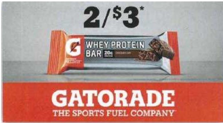
Hartshorn Dep., Ex. 8.