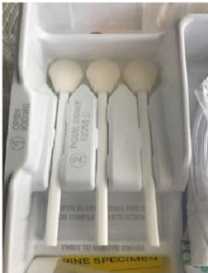
SureStep Bag Kit