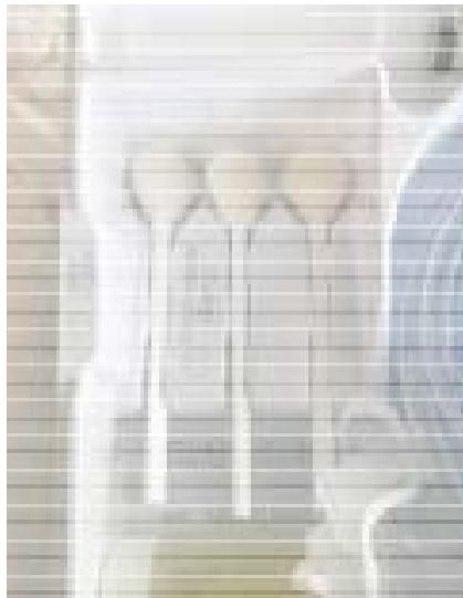
SureStep Meter Kit