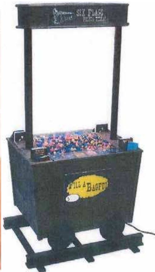
Squire Boone's Discontinued Product

The court previously held that the idea, which cannot be copyrighted, is a life-size ore car used to display rocks/gem stones for purchase, and the expression of that idea, which can be copyrighted, is a rustic finished, trapezoidal ore car sitting atop a piece of