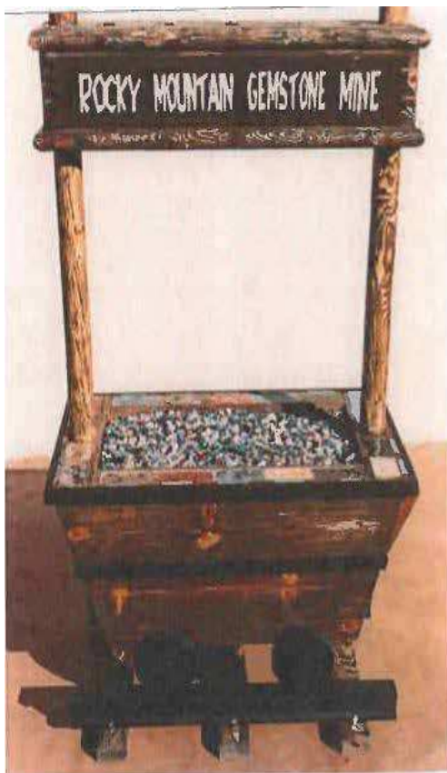
Silver Streak's Product

The court will again begin its analysis with a side by side comparison of the two products. The court only has photographs and has not seen the actual products.