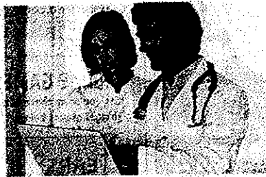
Concentra ignites your memory function and reactivates your memory.

“It was like a switch turned on inside my brain! With Concentra I noticed everything began to change. I felt more awake than usual. Reading the newspaper was easier. I think faster and I talk with more confidence. With Concentra I feel alive again!”