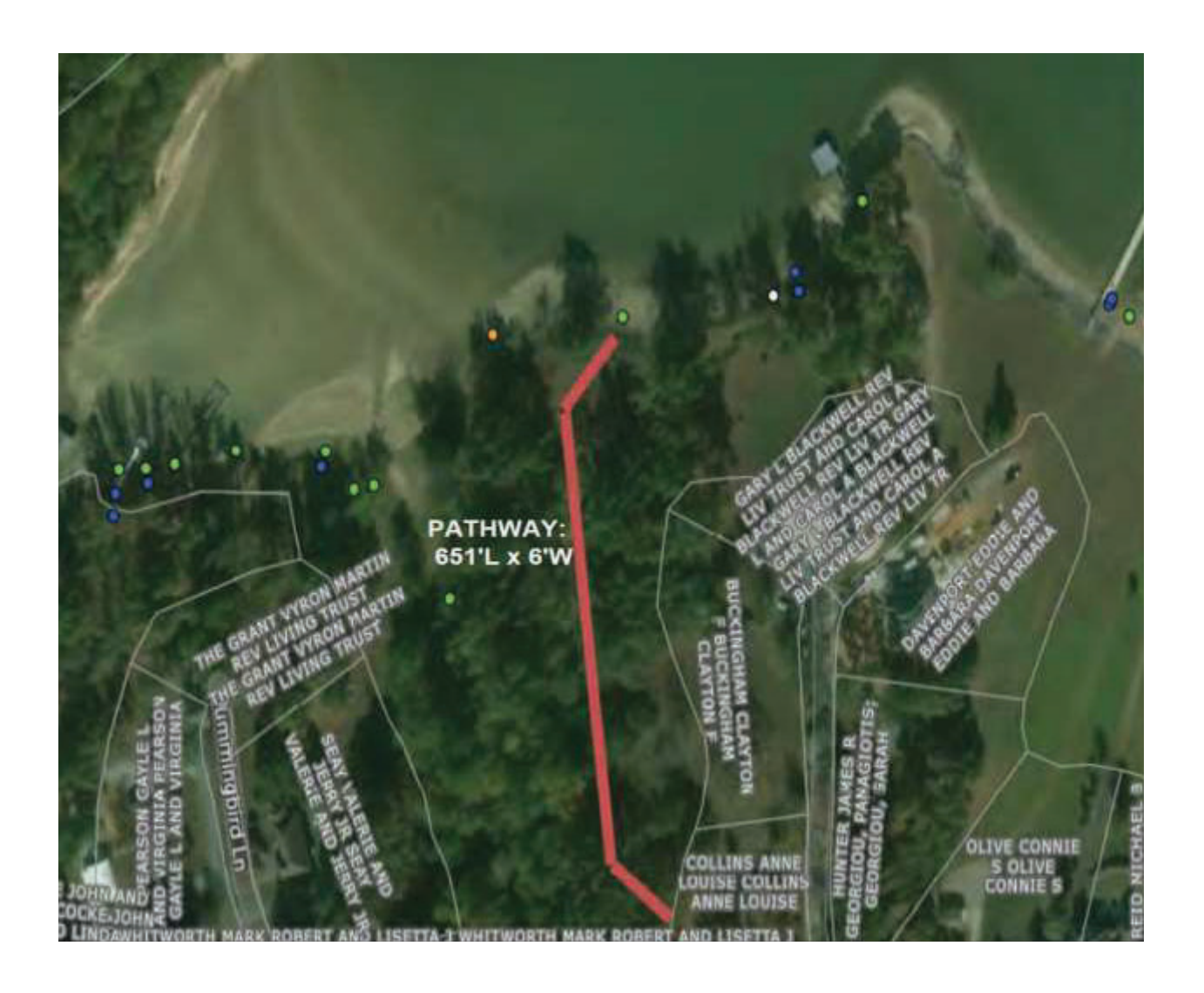
Works' 26a Permit (DN 1-8) at 6