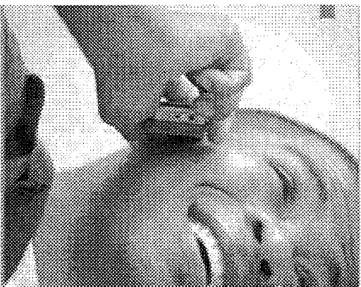
A Demonstration of vCurrent Mobile Handset Updating

Red Bend products are covered by US patent number 6,546,552, Canada patent 2,339,923, Australia patent AU 761019, Singapore patent 78866 and other patents pending.