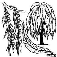
weeping willow Salix babylonica

wee (wē) adj. we•er, we•est. 1. Very small; tiny. See Syns at small. 2. Very early: the wee hours of the morning. — n. Scots. A short time; a little bit. [ME wēi, we , a small amount, small < OE wēge, wēg , weight. See wegh•* .]