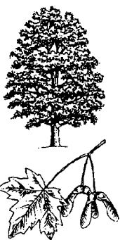
sugar maple Acer saccharum