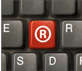
Businesses are built on branding.

800-747-9354 mail@dglegal.com Contact | Locations