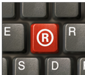
Businesses are built on branding.

800-747-9354 mail@dglegal.com Contact | Locations