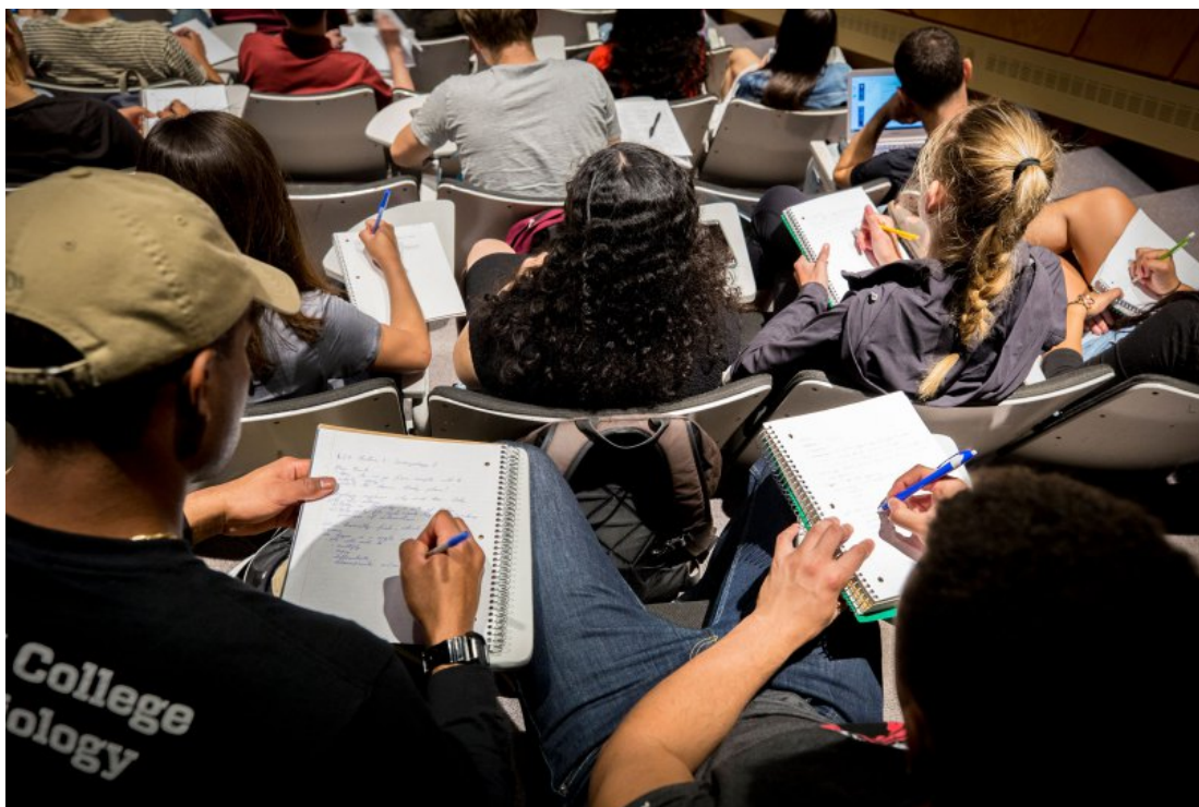
With a record applicant pool, Harvard has admitted 1,962 students to the Class of 2022.