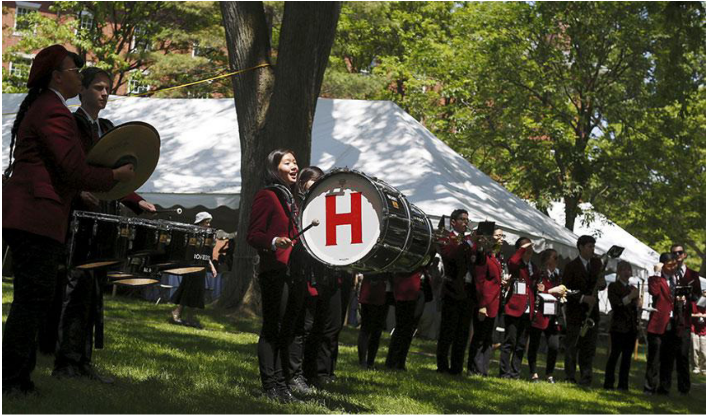
BANGING DOWN THE DOOR: A pep band drummer plays at Harvard Yard in Cambridge, Massachusetts. The college is one of America's most selective; this year, it accepted 1,990 of the record 37,307 who applied.