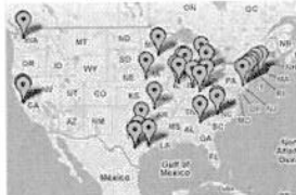
Show: Top 50 | 25 Most Profitable | Fortune 500