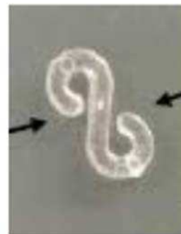
Figure 2 Tristar's S-Clip

Choon's alleged that the Bandaloom S-Clip infringed the '441 patent literally and under the doctrine of equivalents. The Court granted Tristar summary judgment on Choon's literal infringement claim and found that, because "Tristar fails to address Choon's claim that the Bandaloom [S-Clip] infringes claim 16 under the doctrine of equivalents[,] . . . [that] claim survives summary judgment." [ECF No. 138, PageID.6395].