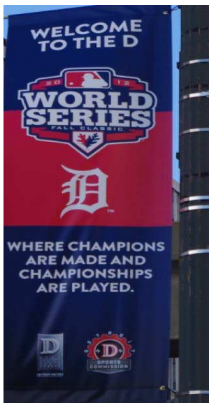
(ECF #1-1 at 9, Pg. ID 19)