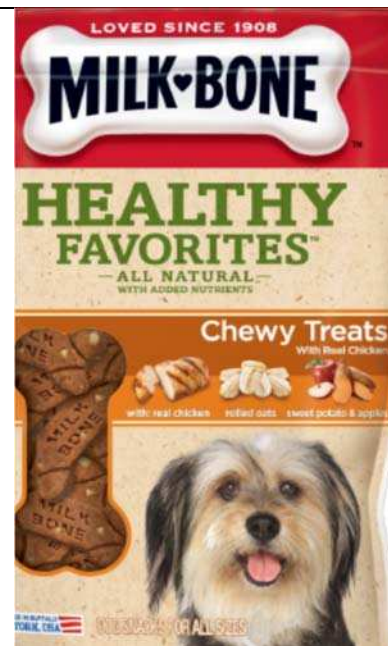
Healthy Favorites Chewy Treats with Real Chicken (Wysong Corp. v. Big Heart Pet Brands et al., Civil Action No. 16-11823, ECF #1-3 at Pg. ID 58; ECF #16-2 at Pg. ID 143.)