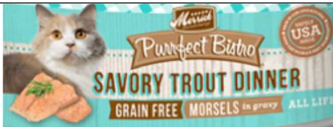
Purrfect Bistro Savory Trout Dinner Morsels in Gravy ( Wysong Corp. v. Nestle Purina Petcare Company , Civil Action No. 16-11827, ECF #1-2 at Pg. ID 45.)