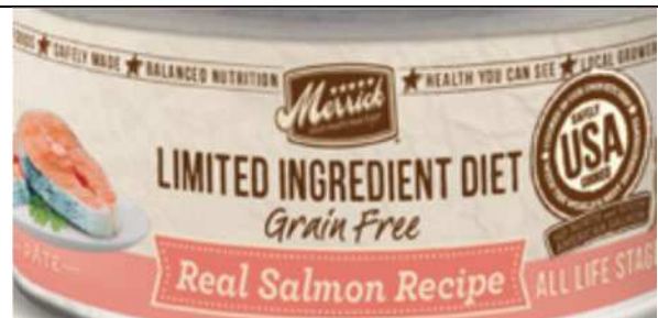
Limited Ingredient Diet Real Salmon Recipe ( Wysong Corp. v. Nestle Purina Petcare Company , Civil Action No. 16-11827, ECF #1-2 at Pg. ID 48; ECF #16-3 at Pg. ID 248.)