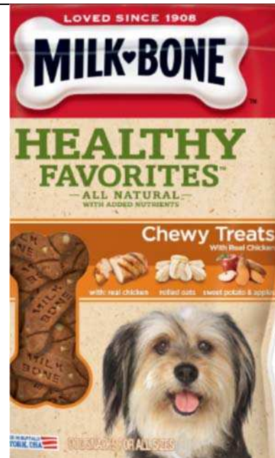
Healthy Favorites Chewy Treats with Real Chicken (Wysong Corp. v. Big Heart Pet Brands et al., Civil Action No. 16-11823, ECF #1-3 at Pg. ID 58; ECF #16-2 at Pg. ID 143.)