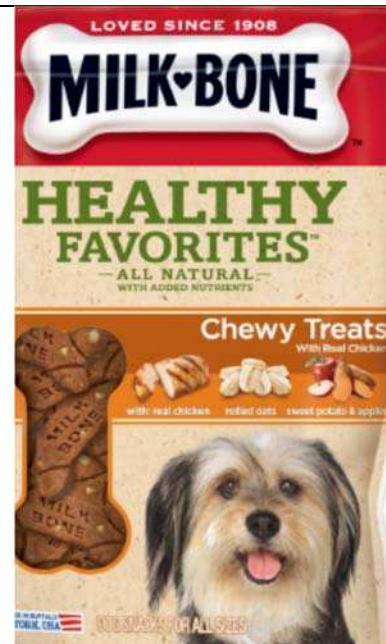
Healthy Favorites Chewy Treats with Real Chicken (Wysong Corp. v. Big Heart Pet Brands et al., Civil Action No. 16-11823, ECF #1-3 at Pg. ID 58; ECF #16-2 at Pg. ID 143.)