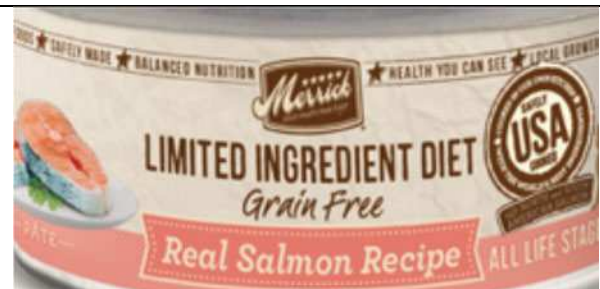
Limited Ingredient Diet Real Salmon Recipe ( Wysong Corp. v. Nestle Purina Petcare Company , Civil Action No. 16-11827, ECF #1-2 at Pg. ID 48; ECF #16-3 at Pg. ID 248.)