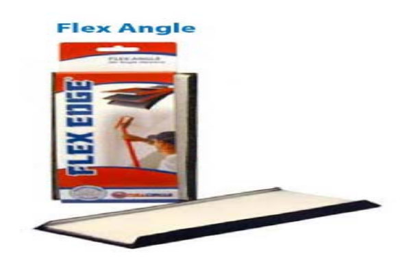
Photograph of the Flex Angle pad