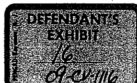
EXHIBIT B Affidavit of Kent O'Grady 09-CV-1116 (DWF/LIB)