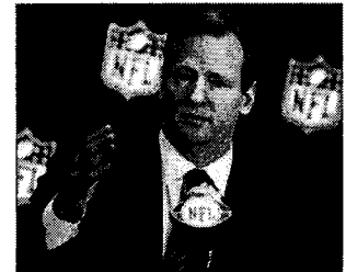
CAPTION

Roger Goodell NFL Draft Amani Toomer Chad Ochocinco Mediation Lockout