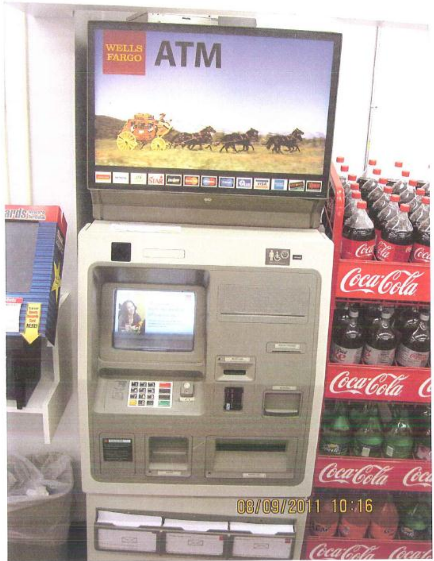
(Curtis P. Zaun Aff., Ex. 8, Feb. 3, 2012, Docket No. 39.)