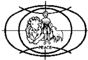
Reg. No. 1,044,453