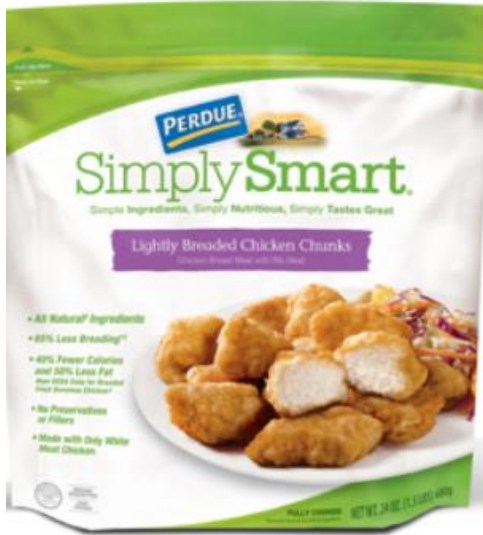
Fig. no. 1. A representative sample of the current packaging for Perdue's Simply Smart product line. Filing 25-5 at 4.