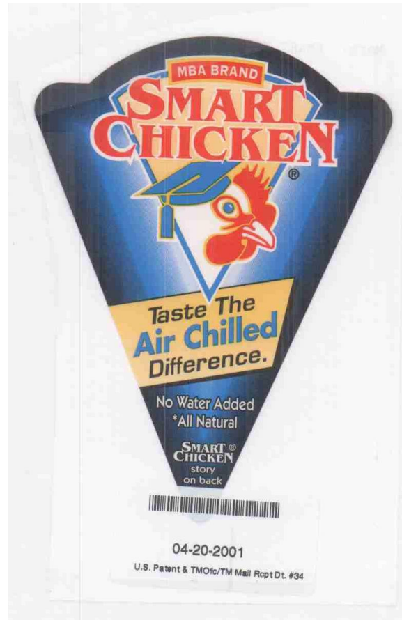
Fig no. 2. Tecumseh's Smart Chicken label. Filing 25-4 at 7.

The Simply Smart products are packaged in white bags with green borders. Filing 25-5 at 4. In the top center is the Perdue house mark, next to a picture of an idyllic farmhouse in front of several chicken coops. Filing 25-5 at 3–4. Below this, printed in large letters, is "Simply Smart ," and underneath, in smaller print, "Simple Ingredients , Simply Nutritious , Simply Tastes Great ." Filing 25-5 at 3–4. In the center of the bag is a rectangle with the specific type of chicken product listed, e.g., "Lightly Breaded Chicken Chunks," with a different color for each type of chicken product. Filing 25-5 at 3–4. The bottom half of the package contains a photograph of the product, served on a plate with vegetables or a garnish. Filing 25-5 at 3–4.