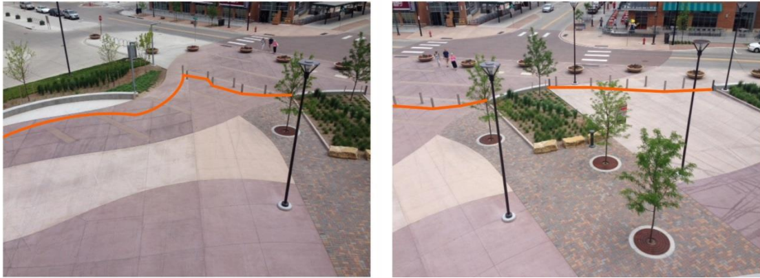
Figure 2: Plaza area photographs (Policy, Filing No. 1-7 at ECF 4-5.)

boundary elements precisely, nor does it follow the distinctive concrete coloring which is carried outside the Plaza Area onto public sidewalks and into the street.