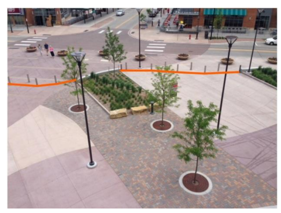
Figure 2: Plaza area photographs (Policy, Filing No. 1-7 at ECF 4-5.)

Though these boundary elements may be less distinctive than those in other cases where courts declared areas to be nonpublic forums, the Court does not consider such physical barriers in a vacuum. The Court must also "[acknowledge] the presence of any special characteristics regarding the environment in which [the Plaza Area] exist[s]." Bowman, 444 F.3d at 975. The Plaza Area has several special characteristics that distinguish it from a sidewalk. Unlike the sidewalk in United Church of Christ , 383 F.3d at 452, it cannot be said that the Plaza Area seamlessly blends into the urban grid, borders the road, or looks like a public sidewalk. Although the stanchions and planter boxes may not, on their own, indicate to the public that they have "entered some special type of enclave," Grace , 461, U.S. at 180, the boundary elements combined with the size, shape, and general appearance of the Plaza Area serve to distinguish it from the adjacent public sidewalk. The very presence of a large public sidewalks bordering the Plaza Area signals that the Plaza Area is intended to serve a more limited function. See Int'l Soc'y. For Krishna Consciousness v. Lee , 505 U.S. 672, 680 (1991) ("[S]eparation