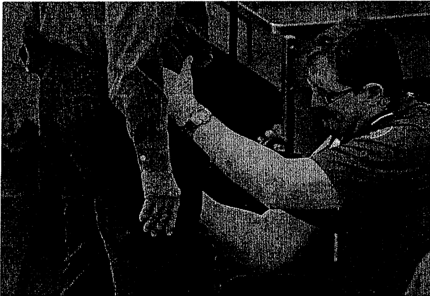
Transportation Security Administration agents perform enhanced pat-downs on passengers at DIA on Wednesday amid growing controversy about the screenings and full-body scanners, one week before Thanksgiving air travelers crowd airports.