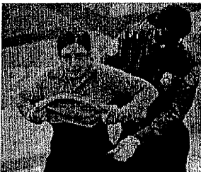
A passenger at Denver International Airport on Wednesday