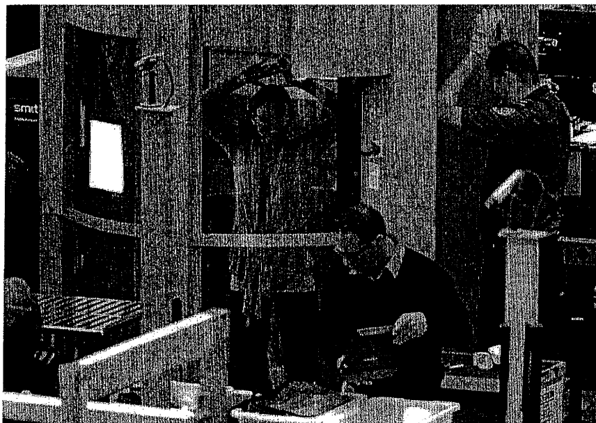
Passengers at Denver International Airport on Wednesday go through a full-body scanner.