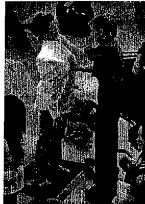
Transportation Security Administration agents perform enhanced pat-downs on passengers at DIA on Wednesday amid growing controversy about the screenings and full-body scanners, one week before Thanksgiving air travelers crowd airports.

Obama asks whether there are less-intrusive options