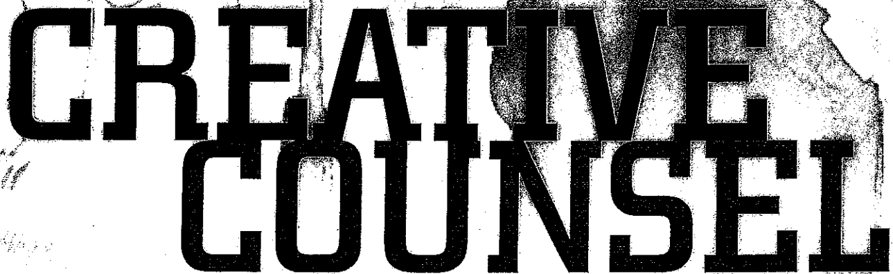
Illustration by Goro Sasaki