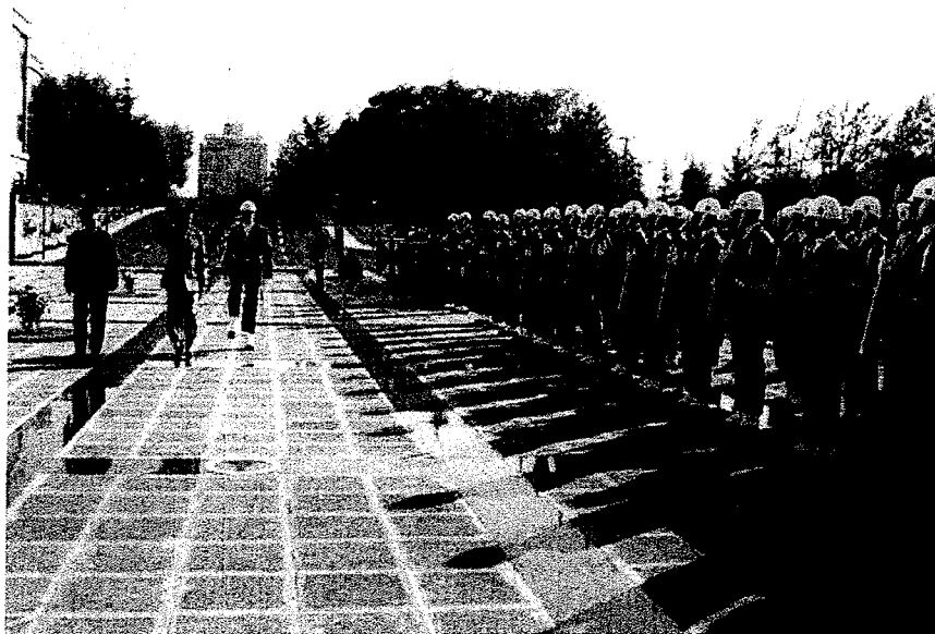
The Chief of Army Staff, General Ashfaq Parvez Kayani reviewing the guard of honour presented by a Contingent of Turkish Land Forces during his visit to Turkey. (6-11-2008)

General Ashfaq Parvez Kayani also visited Martyr Memorial at Galipoli and laid a floral wreath. Later, COAS also visited local area command where he was given operational briefing.