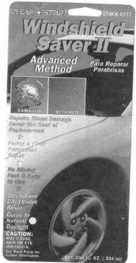
The '936 Copyright: "Clear Star Windshield Saver II – Stock #777 Blister Card"