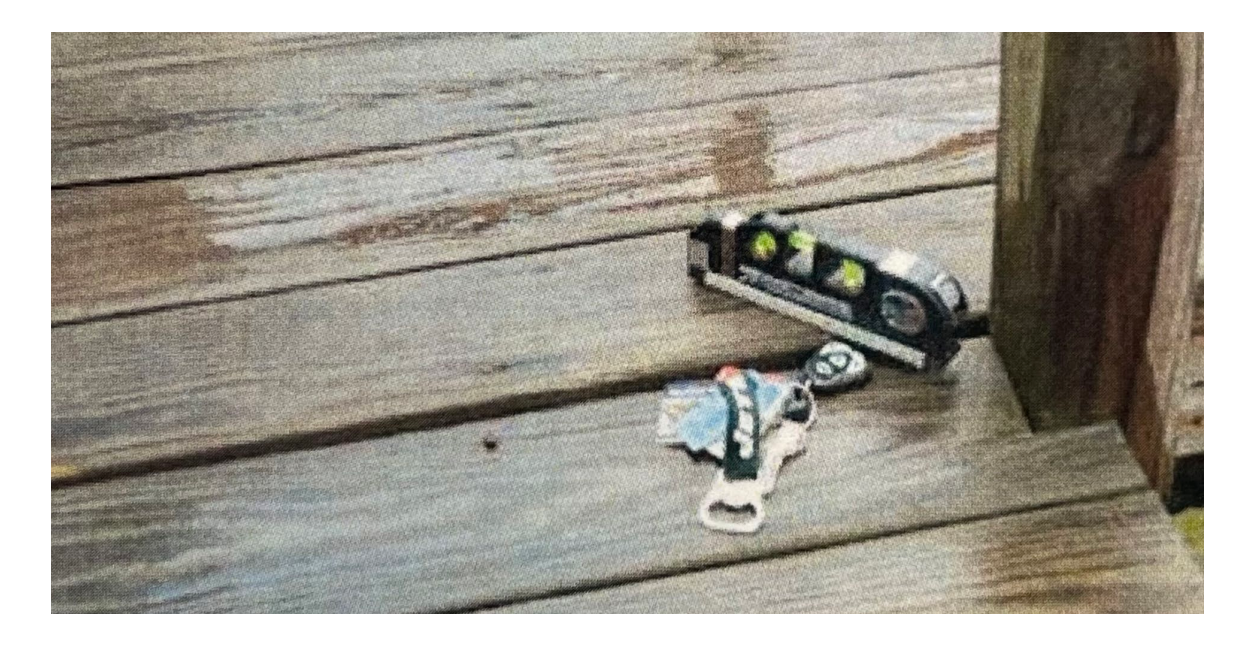
¶¶ 41-42, p. 18 ¶ 2. As shown in the exhibit and the detail above, only a small portion of the board is raised. Other photos supplied in anticipation of trial demonstrate that the identified defect was slight and far off-center, inescapably showing that the ramp was fully functional for its intended use. See Defendant's Exhibit 1. There is no evidence that the MTA had notice of this defect, assuming it was a defect; indeed, plaintiff testified that during more than 100 visits to the headquarters, sometimes using the ramp, he neither noticed nor tripped over the board. ¶¶ 42-44.