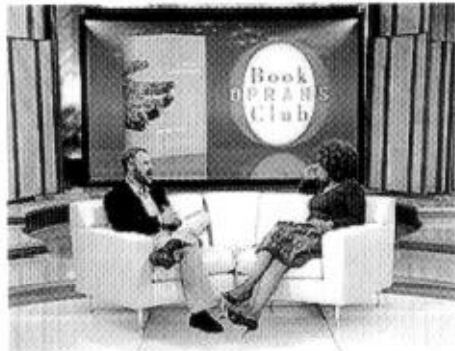
Frey chats with Oprah Winfrey on October 26, 2005 broadcast

himself in a deadly train accident that cost the lives of two female high school students. In what may be his book's most crass flight from reality, Frey remarkably appropriates and manipulates details of the incident so he can falsely portray himself as the tragedy's third victim. It's a cynical and offensive ploy that has left one of the victims' parents bewildered. "As far as I know, he had nothing to do with the accident," said the mother of one of the dead girls. "I figured he was taking license...he's a writer, you know, they don't tell everything that's factual and true."