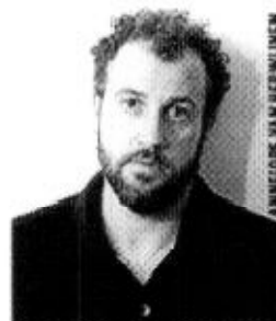
Frey's dust jacket photo from "My Friend Leonard"

In a recent "Meet The Writers" interview for Barnes & Noble's web site ( which you can listen to here ), Frey was asked about his history of incarceration. "I was in jail a bunch of times," he answered, "The last time I was in for about three months." When asked if books offered a bit of solace behind bars, Frey replied, "Yeah, I mean there's nothing to do there. You can go out to the yard and walk around or shoot hoops or lift weights. I didn't really want to do anything, so I spent most of my time reading books." Frey added that during that last three-month stretch he knocked off "Don Quixote," "War