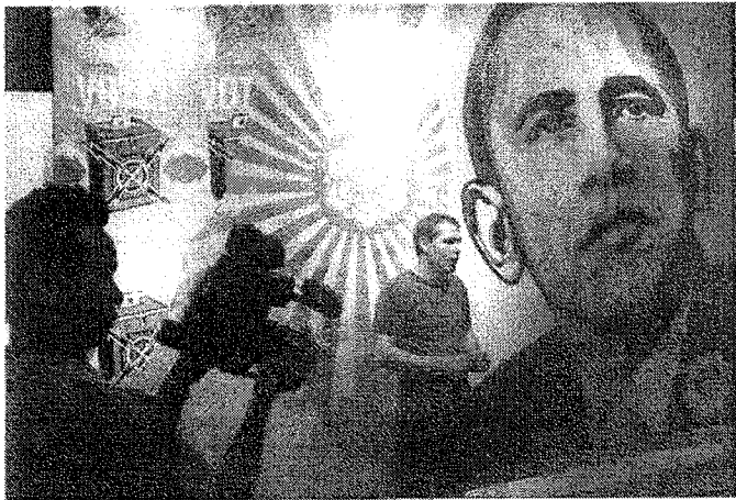
Shepard Fairey -- The Artist

Yosi and I did a show in Denver during the DNC Convention called Manifest Hope and I think [the "Hope" poster image] was symbolic of a lot of things including Hope and it just manifested.