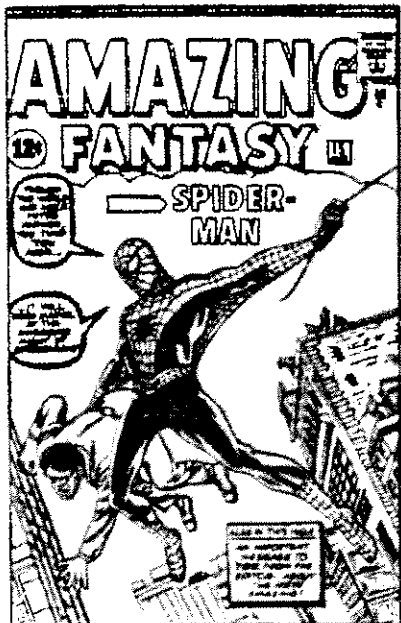
Jack Kirby's muscular, "glassorens" Spider-Man never made it past the web-slinger's first cover appearance.

T o his family, friends and the industry he helped to launch, he is a hero. But to the millions of fans who read Marvel Comics, Stan Lee is better known as a hero maker. Most of Marvel's characters—The Fantastic Four, Spider-Man, Silver Surfer, The Avengers, Iron Man, Hulk, The X-Men—sprang from Lee's fertile imagination in collaboration with legendary artistic talents Jack Kirby and Steve Ditko.