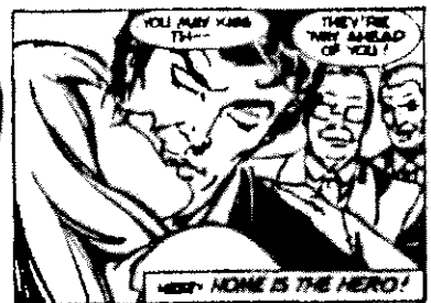
Peter and Mary Jane have finally tied the knot. A match made in heaven? Nope, just a logical move by Lee.

LEE: Sure. Steven Spielberg, George Lucas, Woody Allen, Kurt Vonnegut, Gregory McDonald, who writes Fletch. I go through life having heroes.