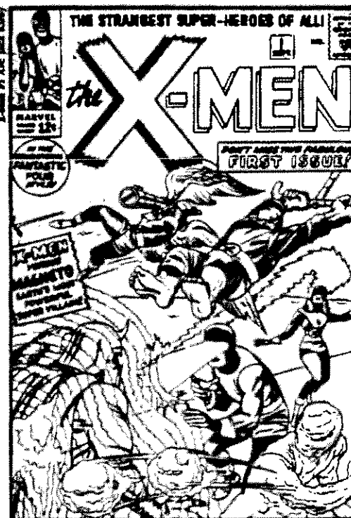
The original X-Men gave Stan Lee a soapbox to sound off on bigotry.

CS: What other characters is New World (continued on page 84)