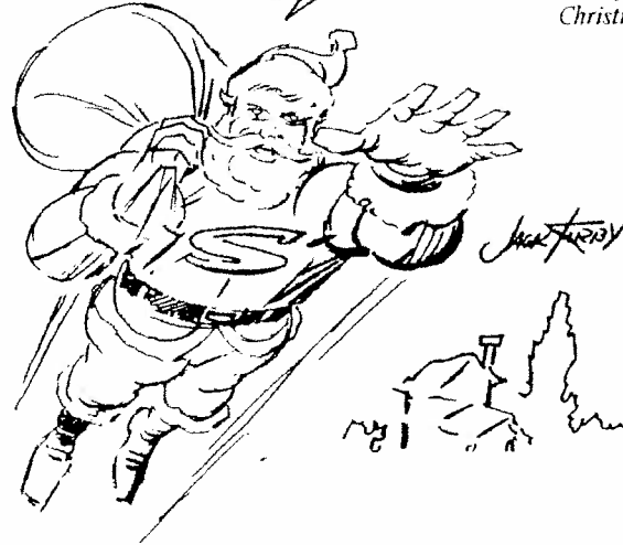
Illustration for a Kirby-family Christmas card.

it book by book, and everybody thought all the books were the same.