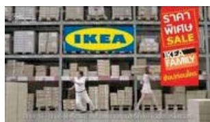
Ikea ad angers Thai transgender group