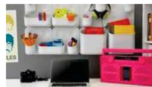
Photos: Modern designs for every room