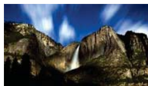
Video: Four seasons in Yosemite