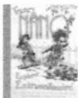
Fancy Nancy: Explorer Extraordinaire! Jane O'Connor