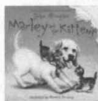
Marley and the Kittens John Grogan