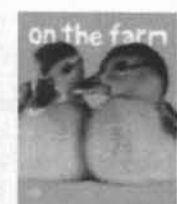
Bright Baby On the Farm Roger Priddy