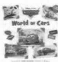
World of Cars Disney Press