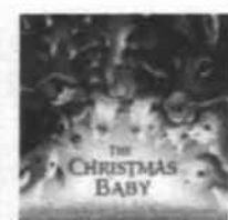
The Christmas Baby