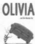
Olivia...and the Missing Toy Ian Falconer