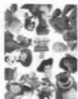
Toy Story 3 Storybook Disney Press