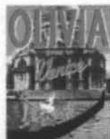
Olivia Goes to Venice Ian Falconer