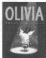
Olivia Saves the Circus Ian Falconer