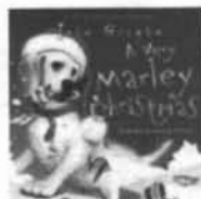
A Very Marley Christmas John Grogan