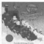
Phineas & Ferb: Oh, Christmas Tree! Disney Press