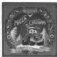
Mater Saves Christmas Disney Press