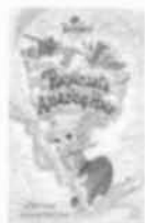
Rapunzel's Amazing Hair Disney Press