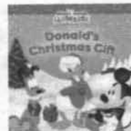
Donald's Christmas Gift Disney Press

The iTunes Store, iBookstore, and App Store are available only to persons age 13 or older and in the U.S. iTunes 10 or later, compatible hardware and software, and Internet access (fees may apply) are required. iBooks 1.2 requires a device running iOS 4.2.1 or later, and is not compatible with the original iPhone or iPod touch (1st generation). Full terms apply, available at www.apple.com/legal/itunes/us/terms.html . For more information see www.apple.com/itunes/ . Content prices and availability subject to change.