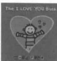
The I LOVE YOU Book Todd Parr