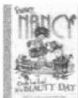
Fancy Nancy: Ooh La La! It's Beauty Day Jane O'Connor