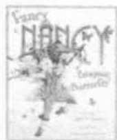
Fancy Nancy: Bonjour, Butterfly Jane O'Connor