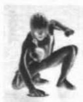
TRON: The Movie Storybook Disney Press