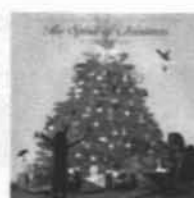
The Spirit of Christmas