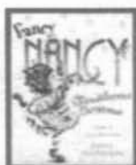
Fancy Nancy: Splendiferous Christmas Jane O'Connor