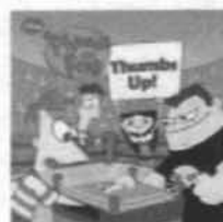
Thumbs Up! Disney Press