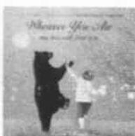
Wherever You Are Nancy Tillman