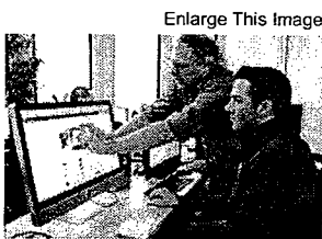
Enlarge This Image

Music fans looking to clear out some clutter can always try to sell their old CDs. But can someone resell an old digital music file of "Thriller" that's languishing on a computer?