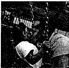
Laid Off and Struggling to Provide