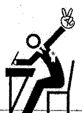
Room for Debate: Taking a Test to Run for Office