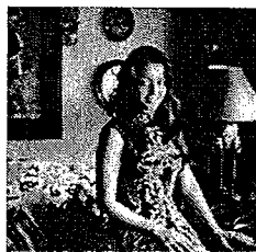
Kolkata, India's Cultural Bedrock