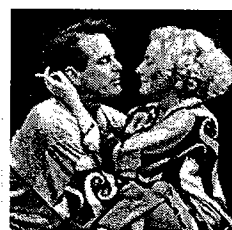
Kim Cattrall Stars in 'Private Lives'