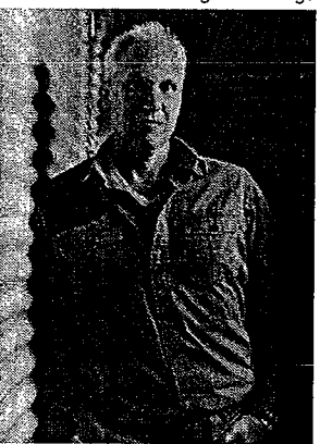
Enlarge This Image

ReDigi's Web site explains how to sell and buy used digital music files. The service says that it complies with copyright law.