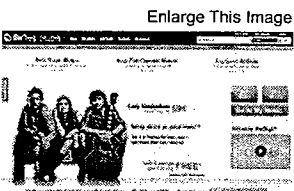
Enlarge This Image

A legitimate secondhand marketplace for digital music has never been tried successfully, in part because few people think of reselling anything that is not physical. But last month a new company, ReDigi, opened a system that it calls a legal and secure way for people to get rid of unwanted music files and buy others at a discount.