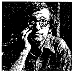
Woody Allen: A Documentary