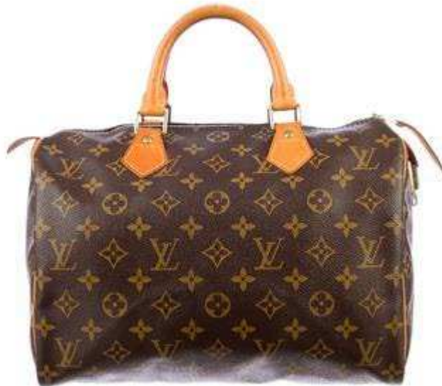
Fig. B. – Louis Vuitton SPEEDY® Toile Monogram