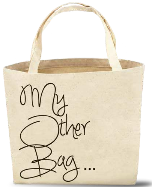
Fig. C. – My Other Bag’s Zoey – Tonal Brown Tote (Front)