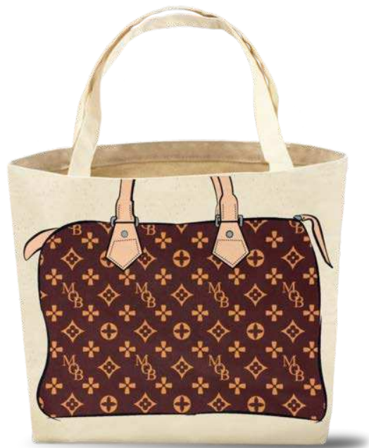
Fig. D – My Other Bag’s Zoey – Tonal Brown Tote (Back)