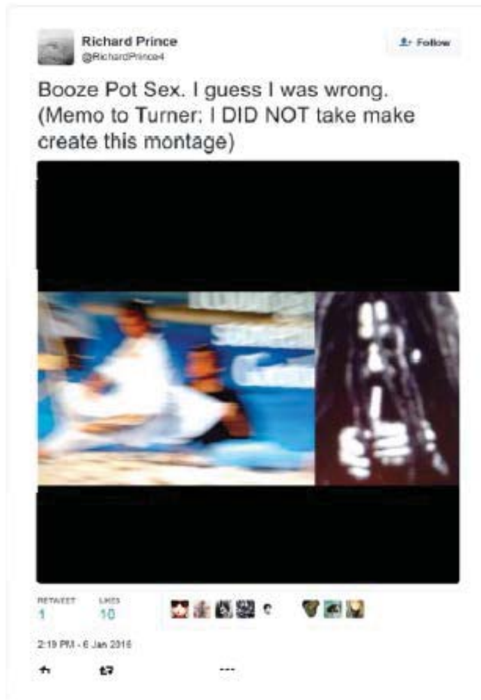
The Twitter Compilation (Fig. 4)

not the subject of Graham's Rastafarian Smoking a Joint ), accompanied by the message: "My lawyers say I can't post Richard Avedon's portrait of Rastaj's post of man with dreads smoking weed. I'm mixed up." ( Id. ¶ 55.) Later that same day, Prince posted a compilation of two somewhat blurry images to Twitter (the "Twitter Compilation"), one of which allegedly features a copy of Graham's Rastafarian Smoking a Joint . (Compl. ¶ 56, Ex. G; see Fig. 4 annexed to this Opinion.)