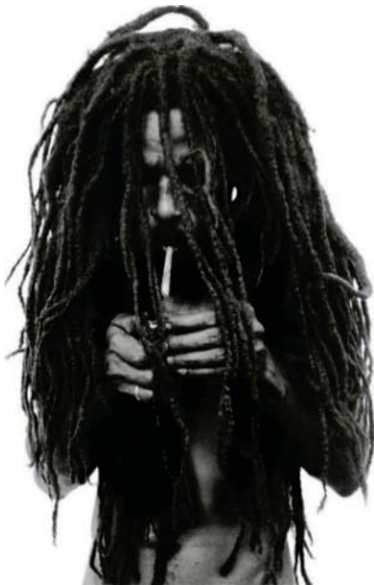
Graham’s Rastafarian Smoking a Joint (Fig. 1)

rastajay92’s Instagram post, which now included his own comment, 5 as well as the other elements of the Instagram graphic interface: rastajay92’s username and comment, the number of “likes” rastajay92’s post had received – 128 in this instance – and the number of weeks that elapsed between rastajay92’s post and Prince’s screenshot – three weeks here. ( Id. ¶ 34.) Prince then printed – or arranged for someone else to print – the screenshot onto canvas in order to create the final artwork at issue in this litigation: Untitled . ( Id. ¶ 34, Ex. B; see Fig. 2.)