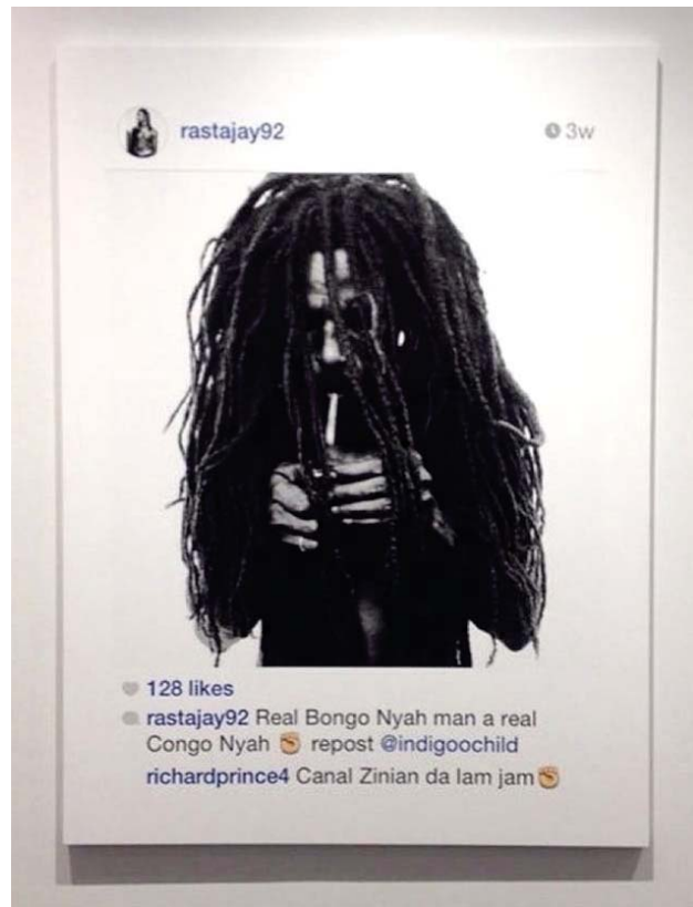
Prince’s Untitled (Fig. 2)