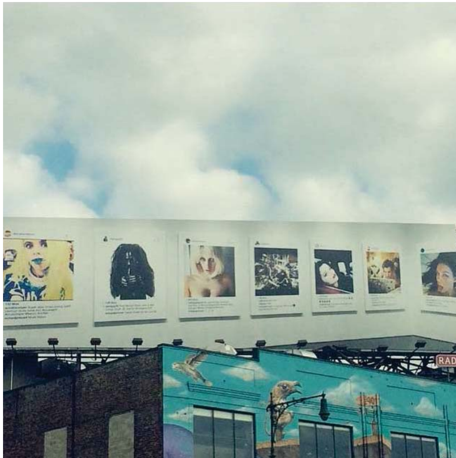
The Billboard (Fig. 3)

whether it was erected before the New Portraits exhibition closed in October 2014.